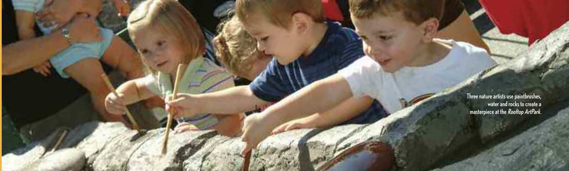
Three nature artists use paintbrushes, water and rocks to create a masterpiece at the Rooftop ArtPark .