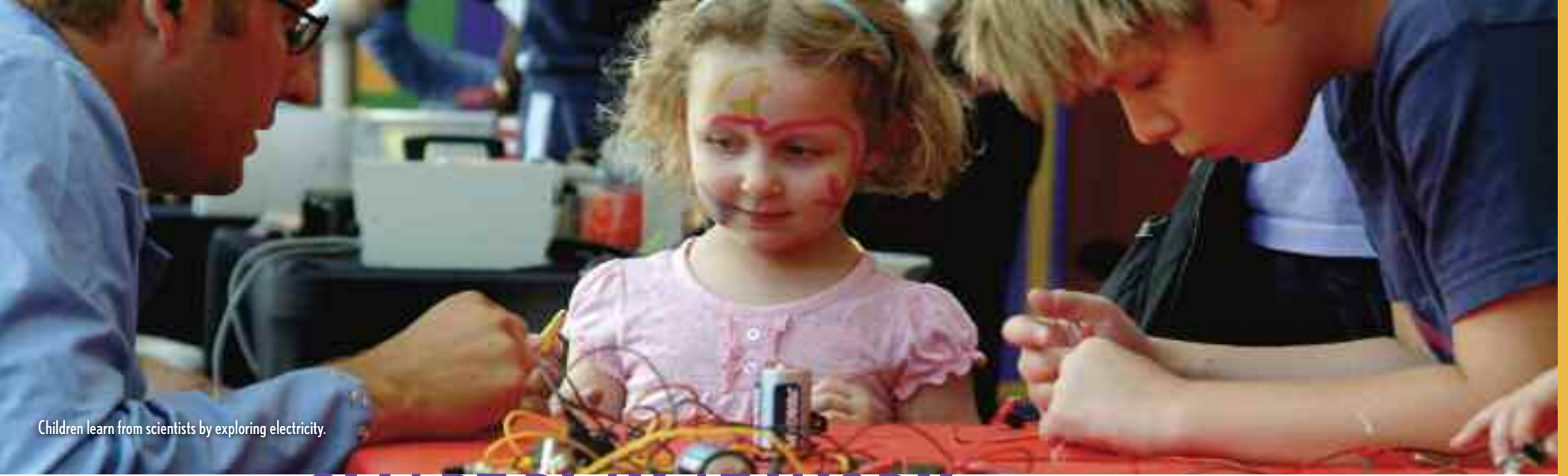
Children learn from scientists by exploring electricity.