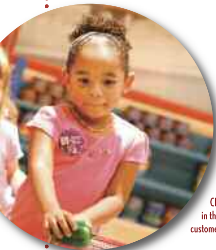
Children take on many different roles in the Our World gallery, including a customer shopping for groceries.

City of St. Paul Cultural STAR Program State of Minnesota